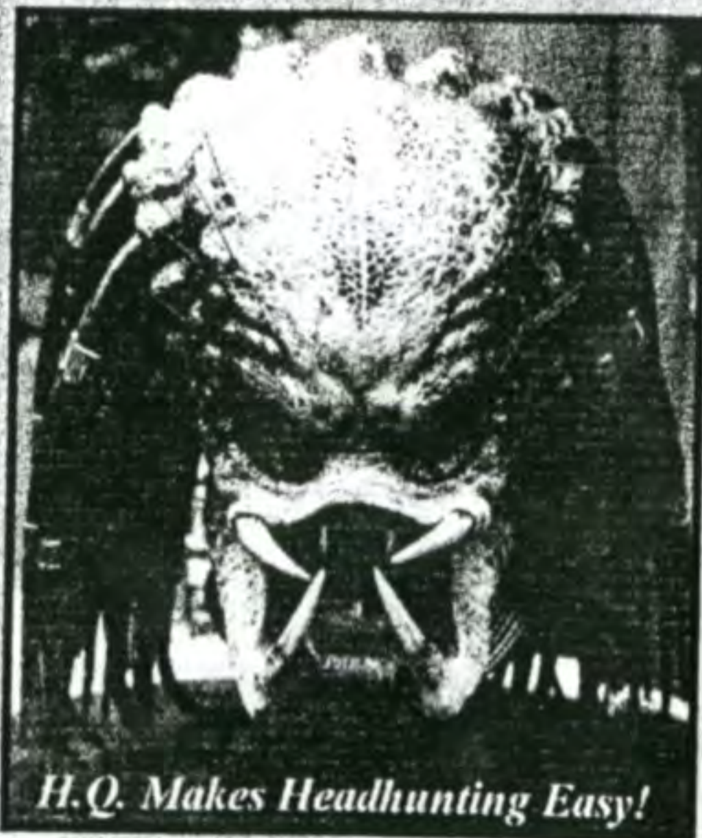
H.Q. Makes Headhunting Easy!

(313) 937-1193 or www.mcdongalshq@aol.com