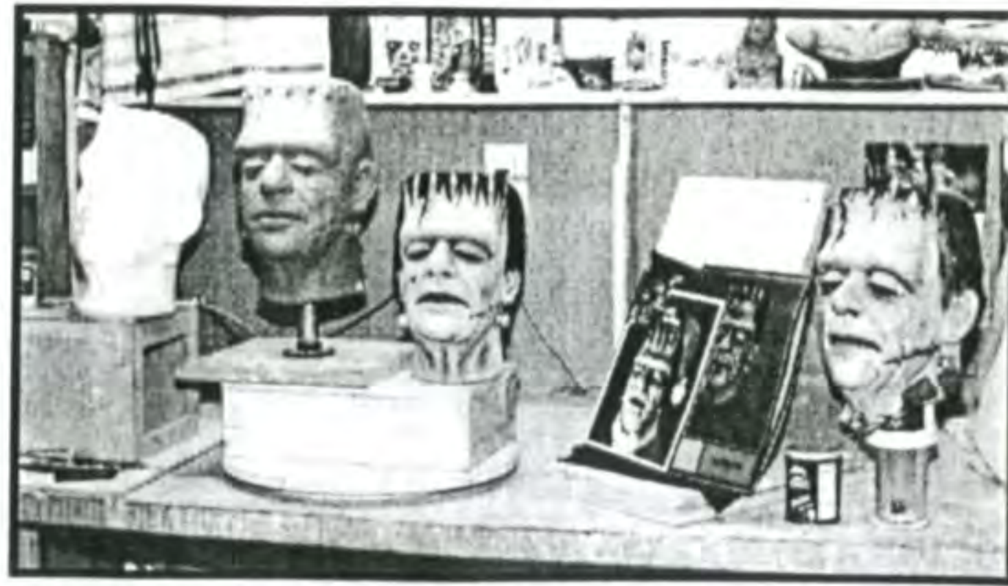
FOR REFERENCE DURING THE PROJECT, DARREN USED THE SCANNING MASTER (LEFT), EVIL WILHELM'S PERSONAL COPY (CENTER), SEVERAL '60'S ERA PHOTOS, AND AN OLD CRUMBLING FOAMED HEAD (FAR RIGHT) ONCE ON DISPLAY IN THE HOLLYWOOD WAX MUSEUM.

For reference, Evil had provided a foam filled casting made back in the '60's for the Hollywood Wax Museum. Despite its aged condition, the original detailing was intact: The tight wrinkles bordering the mouth, the prismatic edges of the crainial clamps, even tiny furrows within the forehead gash - all preserved. This antique was to prove invaluable during the restoration.