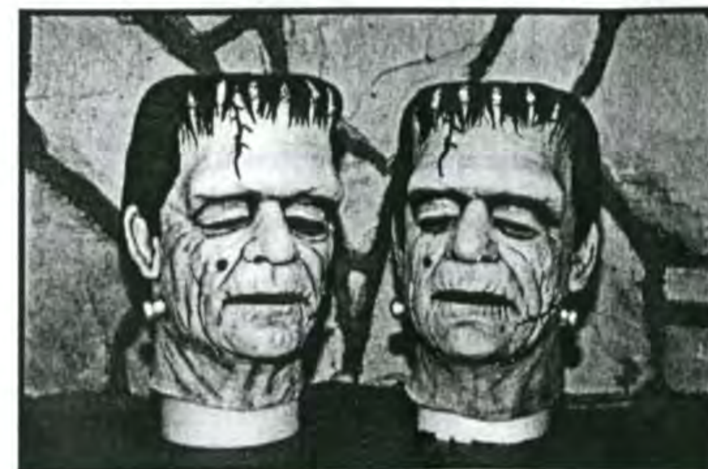
THESE OFFICIAL PROTOTYPES WERE IMPRESSIVE, BUT THEIR TIMEWORN MOLD COULD NOT BEAR CASTINGS TRUE TO THE CHARACTER AS ORIGINALLY SCULPTED IN THE MID 60'S.